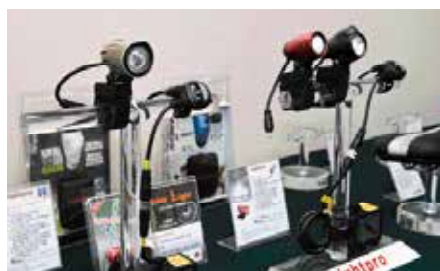
▲Marwi's new lights and saddles.