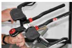
▲ FSA launches their length-adjustable TT rest bar.