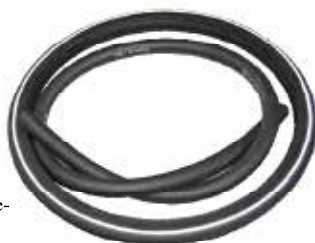
▶ Hutchinson's maintenance-free new tire.

After two years of research and development, Hutchinson introduces the maintenance-free, puncture-free, and pumping-free solid foam rubber inner tubes Urban Tour, 100% made in France. The middle level Equinox 2 road tire weighs 225g. Carbon fiber tubeless road tires weigh 1,600g.