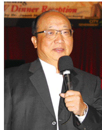
▲ Taichung Mayor Jason Hu welcomes all the bike industry people.

2009, Taichung Bike Week attracted a number of interesting new sponsors and partners in 2010. Bike Expo Munich co-sponsored the welcome dinner in cooperation with the Taichung City government. Cathay Pacific also partnered with Taichung Bike Week to offer reduced-cost air fares from Hong Kong directly to the Taichung airport.