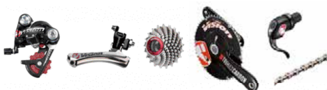
▲ New transmission system from Vision Metron.